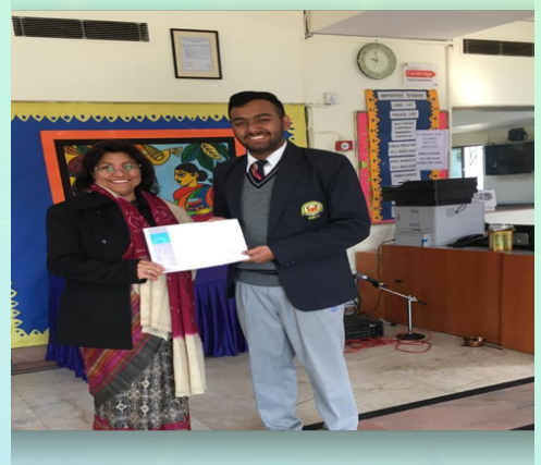
A feet of distinction