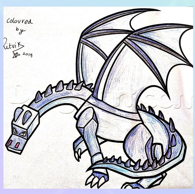
RITVIK VIII A