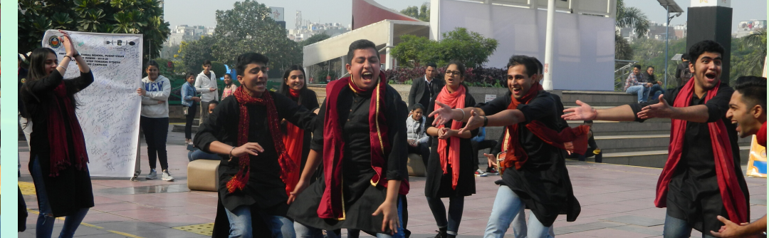
Dramatizing the cause

Youth Power Team Heal-thy-Self, accompanied by their volunteers, went to Select City Walk on 10th December 2019 to promote their cause of fitness. A team of 50 volunteers performed a Nukkad Natak followed by a flash-mob. The Nukkad Natak involved a script revolving around the present trends of fitness like gyming, fit bits, exaggerating on social media etc. in contrast with the traditional styles. The members of team Heal-thy-Self visited the office of Disha Publication in order to address the importance of fitness among the persons with desk jobs. A water bell has been arranged in the school which rings on a daily basis at-9am, 11am and 1pm. It acts as a reminder for all students and school staff to have water at short intervals of time