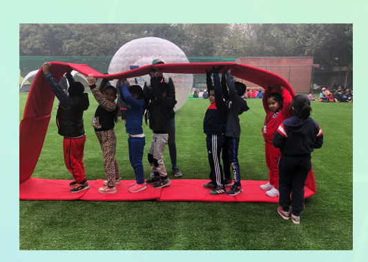
United we stand