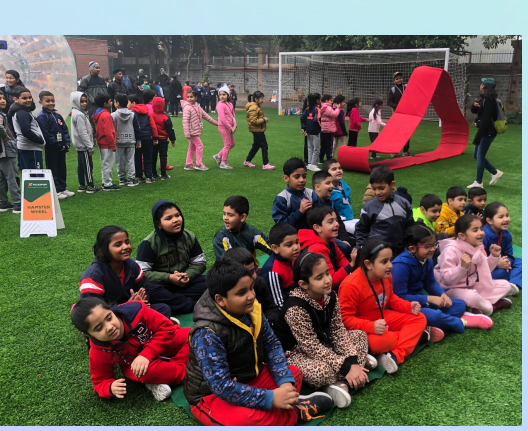
Perked up with attention