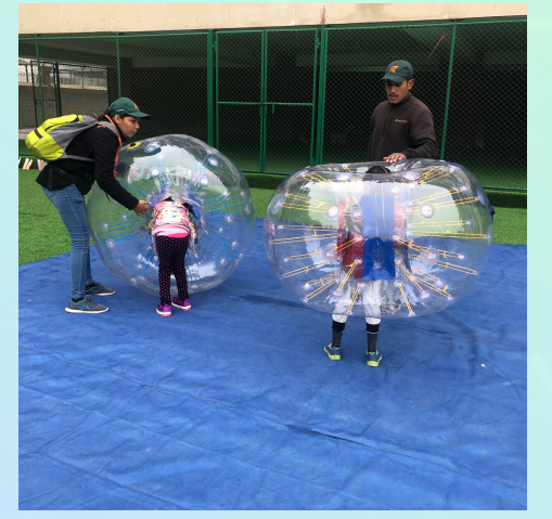
Rock and 'Roll'