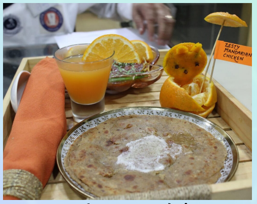
The zesty Mandarin