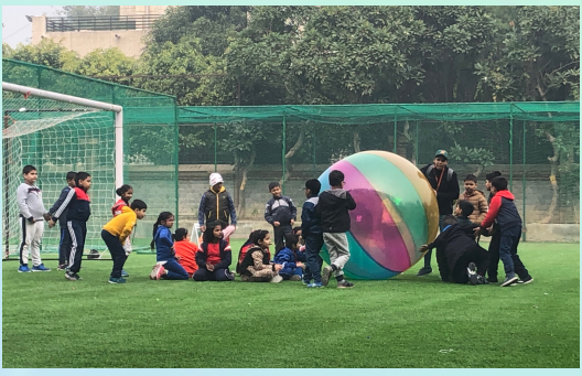
Ab'zorbing' the Energy

Rocksport Adventure Camp was organized on 19th,20th and 23rd December, 2019 for classes K.G. to V. The camp offered the students, various games and activities to enhance their motor skills and their love for games. The main objective of the camp was to develop sportsmanship in the young ones and make them more patient and emotionally powerful.