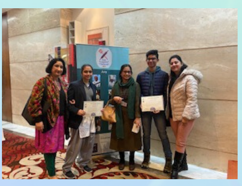
A fine selection of chefs