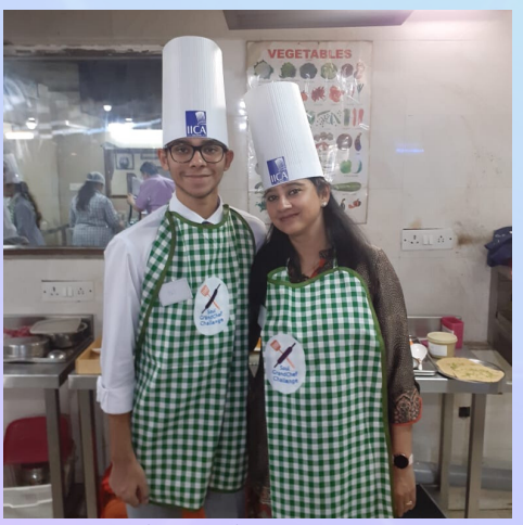
The Mother-Son Duo