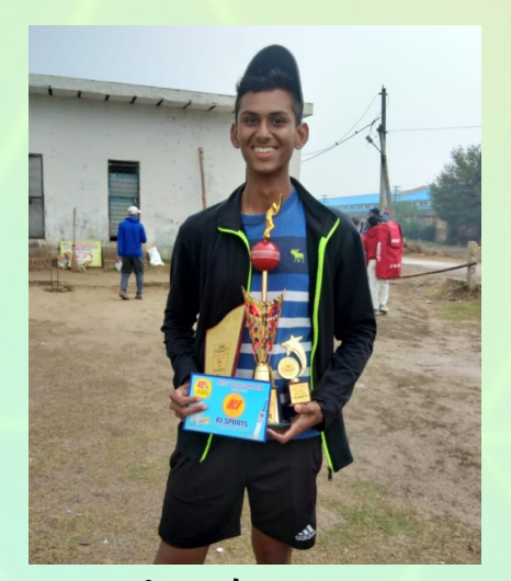
A proud sportsman