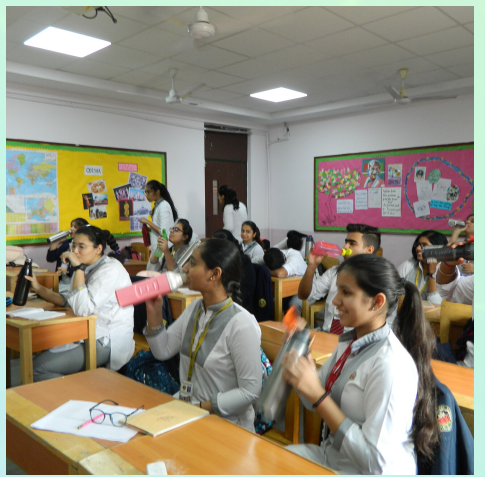
Raising the standards high