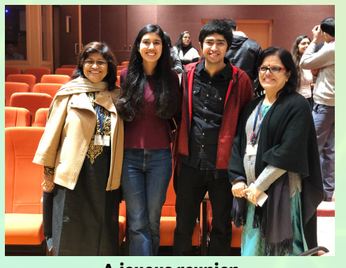
A joyous reunion