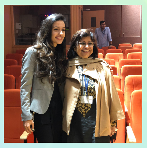
Recalling the memories