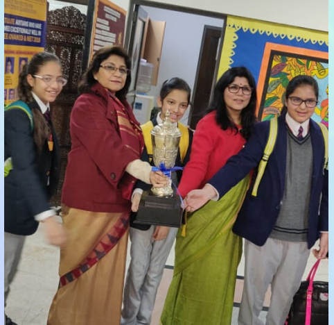
Champions of the day